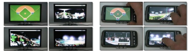
Fig. 3. Screenshots of smart TV(left) and smart phone(right).

We implement the proposed service system and experiment it on real environments. The LadyBug3 of Point Grey is used for a panorama camera of our system. Server modules are implemented with C# based on .Net framework, C language, and LadyBug3 API. Smart TVs and portable smart devices (smart phones, tablet PCs and so on) are developed on the Android platform in Java language and C language with JNI technology. The PC type client is developed with MFC on Windows platform.