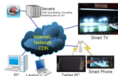
Fig. 1. The architecture of immersive panorama TV service system.

The encoding module receives adjusted panorama images from the post-processing module, and then encodes them. As this point, the images are converted and encoded more than three kinds of resolutions to play on clients effectively and